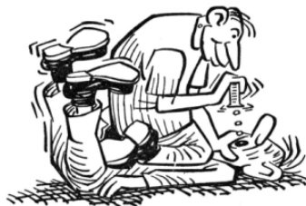
Do you ever have the feeling???

If you or someone you love have any questions about Attention Deficit or what can be done for it, call the office (763) 494-4311 and set up a complementary phone consultation with one of the doctors.