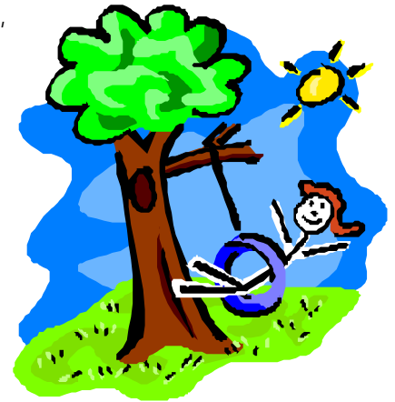
Kids Need Chiropractic Too!

In order to find out the health status of your children's teeth, you consult a tooth specialist. Why don't you do the same with their spines? You will either find out that their spines are healthy (yeah!) or you will be able to do something to insure that your children have the best chance to develop to their full potential.